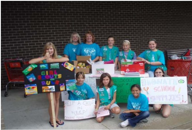
Girl Scouts collecting school supplies for needy children.