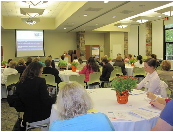
The symposium draws a full capacity crowd at County College of Morris.