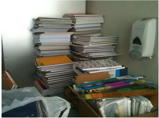
Display signage and some of the items collected during the 2010 School Supply Drive.